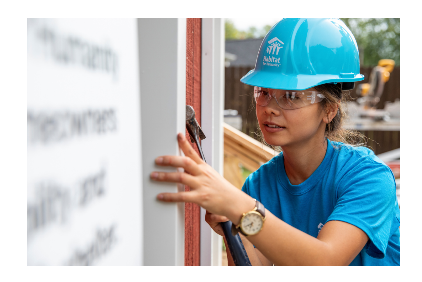
VOLUNTEER RELATIONSHIPS, BEHAVIORS AND COMMUNICATIONS