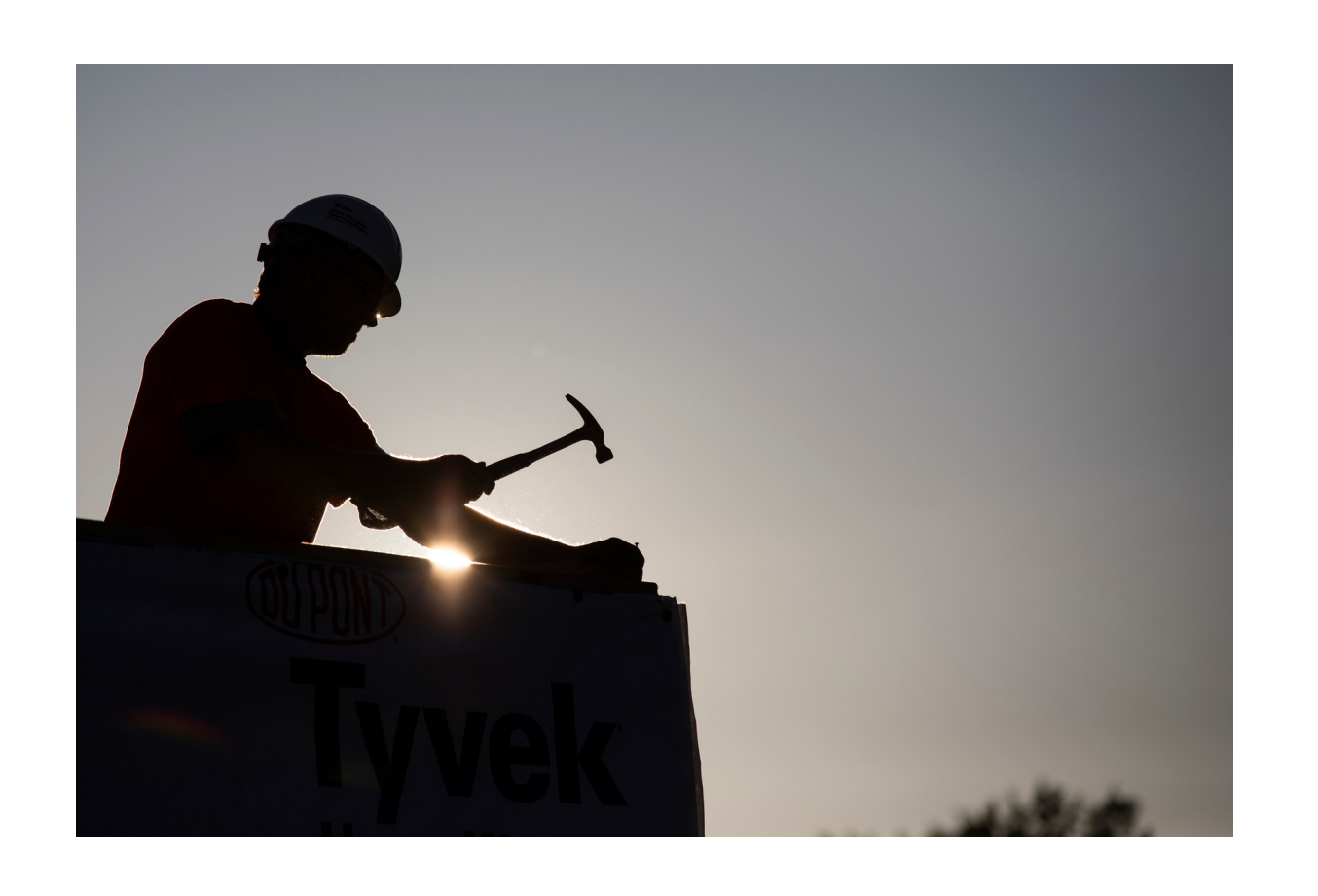
GOVERNING POLICIES AND LAWS FOR VOLUNTEER ACTIVITY